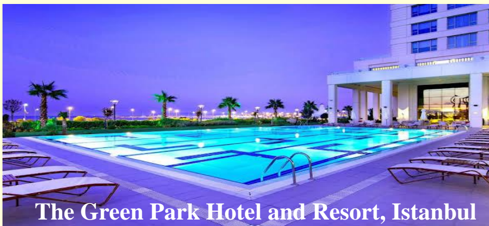
The Green Park Hotel and Resort, Istanbul

So what to wear in September? Bring a rain jacket just in case since it will be raining a few days during this period. Also bring your shorts or a skirt because it can be very warm or even hot. With a water temperature of around 23.0°C (73.4°F), this is a great month to swim so bring your swimwear.